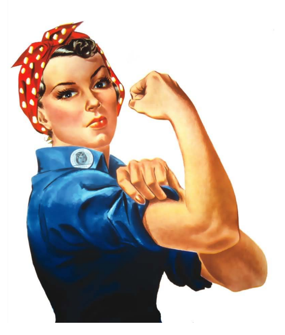
Rosie the Riveter is a cultural icon of the United States, representing the