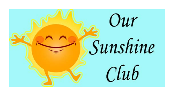
This is where we send

There are no November birthdays on my list. If your birthday is in November and we missed you, please let us know. Happy Birthday!