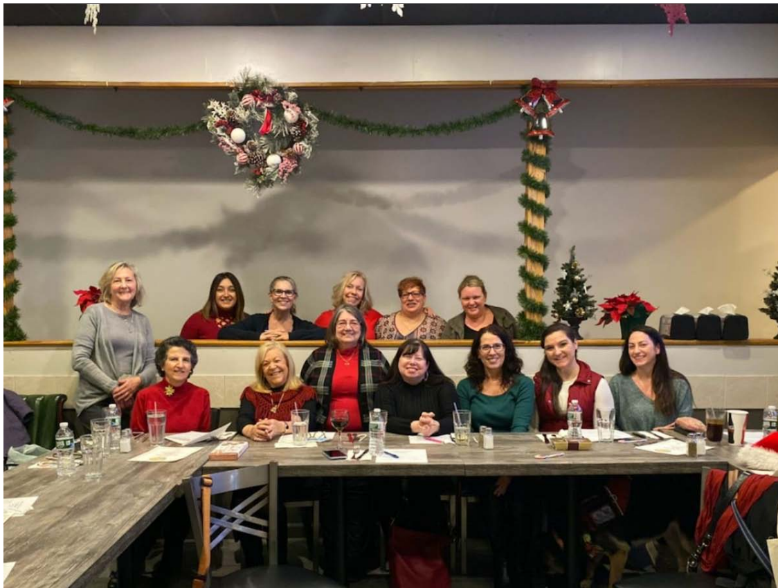
Very nice Holiday Meeting!