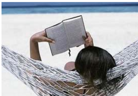
Reading Corner Author: Adrianna Trigianni Title: Big Stone Gap

So where can you find these beautiful lamps? I have purchased quite a few from my local Walmart, but online is another way to go.