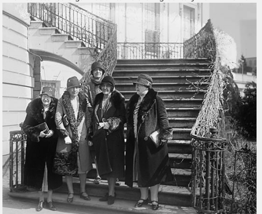
To start the historic countdown, here's a timely factoid in honor of Women's History Month: While mobilizing for World War I, the U.S. government recognized the need for a cohesive group to coordinate identification of women's available skills and experience. A Women's War Council was established to organize the resources of professional women. As a result, the National Federation of Business and Professional Women's Clubs was founded on July 15, 1919.

What is it like to be 100 years old? In about two years, we'll all find out when our storied organization turns the Big Century Mark in 2019!