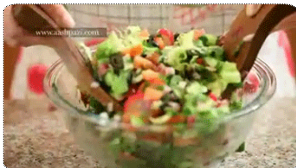
SPINACH GOAT CHEESE BLUEBETTY SALAD (by Carol Lieber)