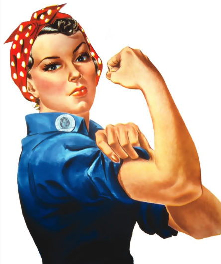
Rosie the Riveter is a cultural icon of the United States, representing the American women who worked in

"You can't be brave if you've only had wonderful things happen to you." Mary Tyler Moore