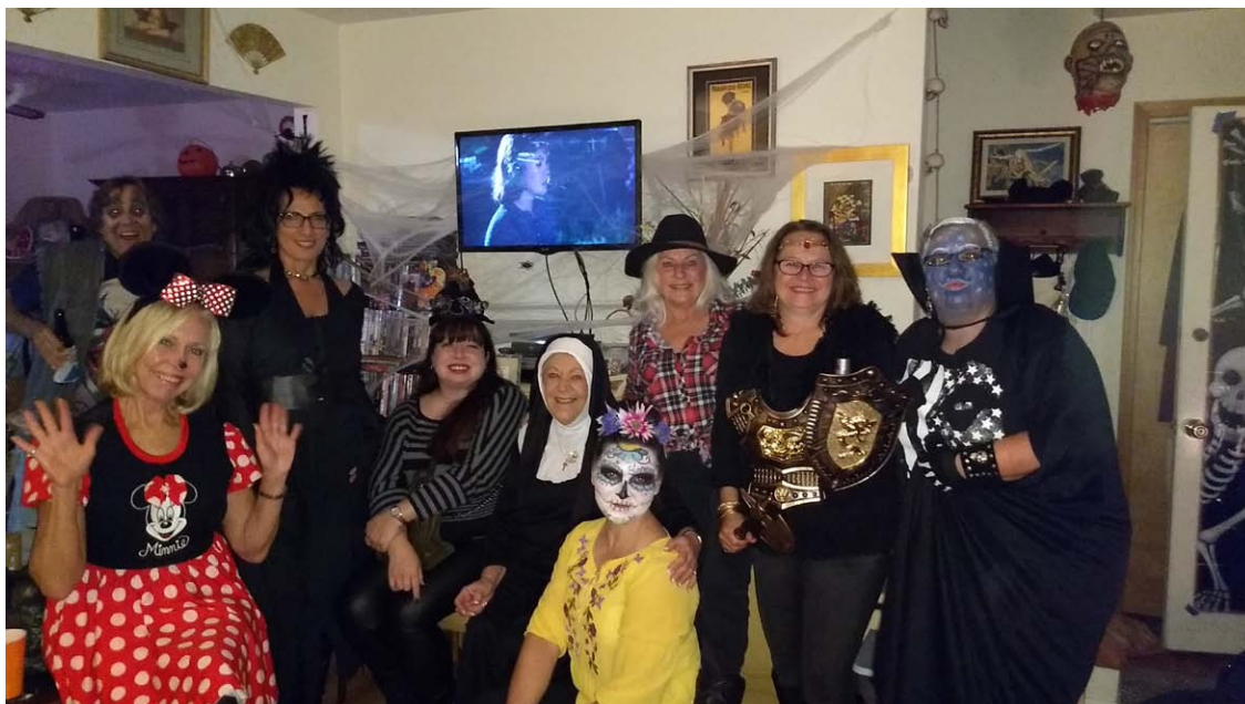
A little Halloween fun!