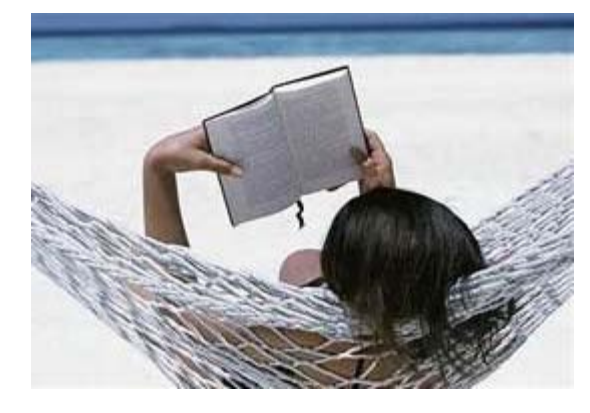
Reading Corner Author: Thomas Benigno Title: The Good Lawyer: A Novel